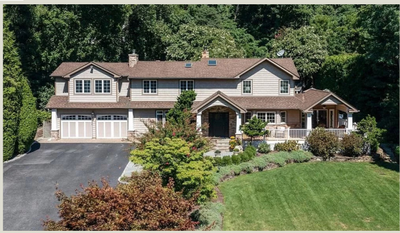
Sold | Northport | 35 Cove Road | $1,589,000*