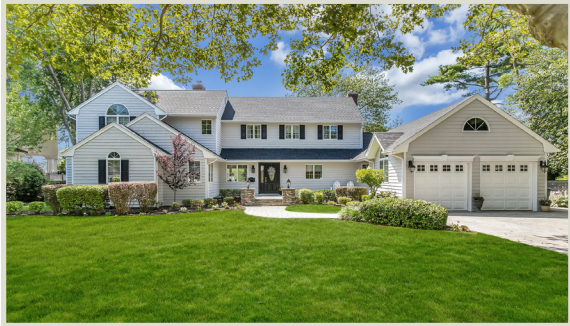
Sold | West Islip | 16 Davison Lane West | $1,500,000