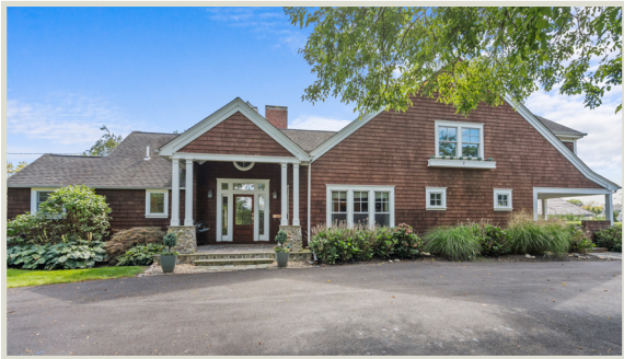
Available | West Islip | 110 West Islip Road $2,099,990 | Web# 3504872