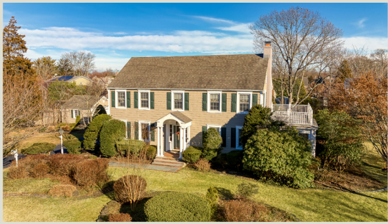
Sold | West Islip | 87 West Islip Road | $1,255,000