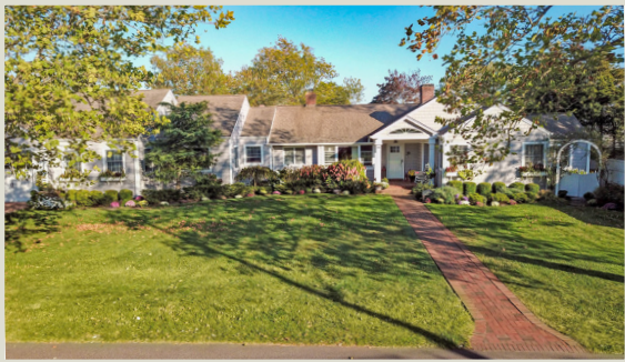
Sold | West Islip | 87 Wagstaff Lane | $1,075,000