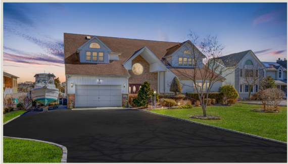
Sold | West Islip | 285 Willetts Avenue | $1,090,000